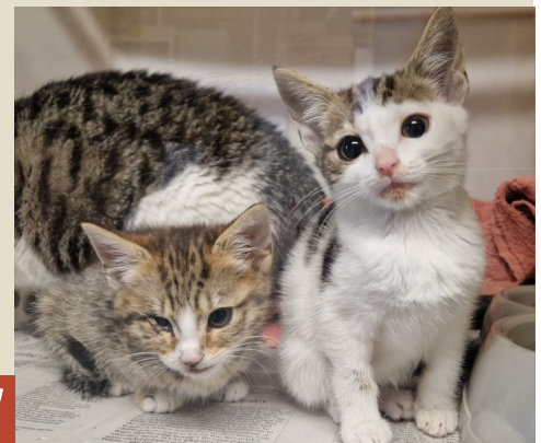
CYBIL & CHARITY

Our staff are now a company of 7 with 4 full time and 3 part time plus a gang of fabulous volunteers. Together our aim is to raise as much money as possible to allow us to help animals like 'Cybil and Charity' who were signed over with their Mum Fleur, when their owner could no longer care for them. All were suffering from cat flu, you can see in the picture Cybil's right eye was badly affected. However, with good nutrition and veterinary treatment Fleur and her babies thrived and went on to be rehomed. Helping animals like these is possible thanks to your support, generous donations and the hard work of staff & volunteers.