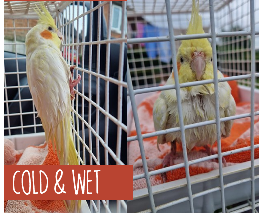
COLD & WET